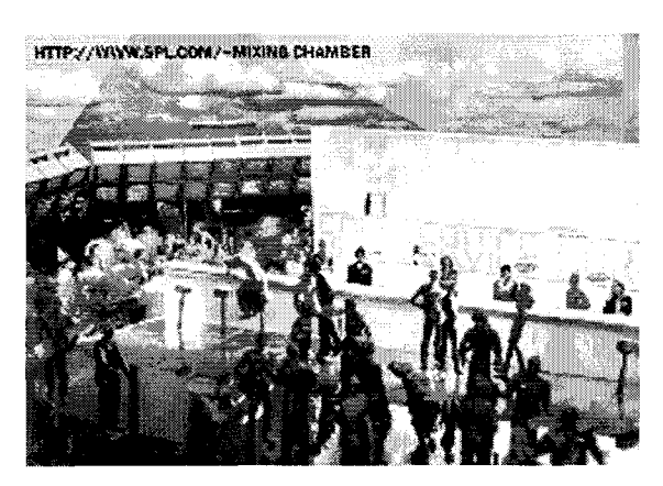
Fig.1 A carnival-like scenario in which the lobby is excited with a melange of activities

I mention my brief exchange with my friend for the reason that it struck me as particularly germane to Rem's manner of reinventing the library. In fact a quick look at his proposal would suggest that he was bent on correcting all that my friend sees as problematic in our age of disengagement. To bring people back into the city, Rem invests the library with a carnival-like scenario in which the electronic